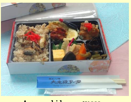
Ayu-meshi box ¥1000