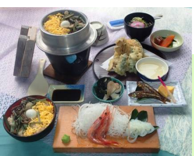
Sansai Kama-meshi Yamanami ¥1500

Reservation of the group is accepts, but because other customers also at the same place, there is a case where vou wait. Please note.