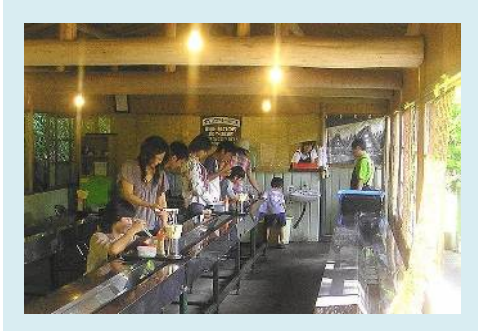
Put juice free & Noodles all you can eat.

Secret spices is spring water from cave.