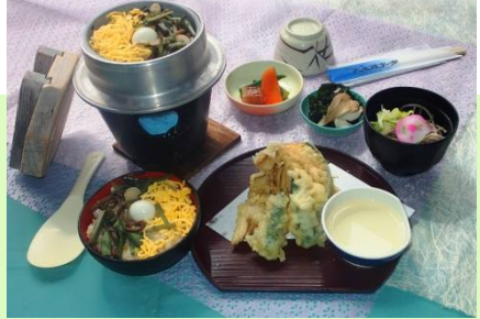
Sansai Kma-meshi Komorebi ¥1000