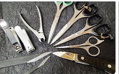
Various scissors, Nail clippers,

Whole products made in Japan Seki city & other cities