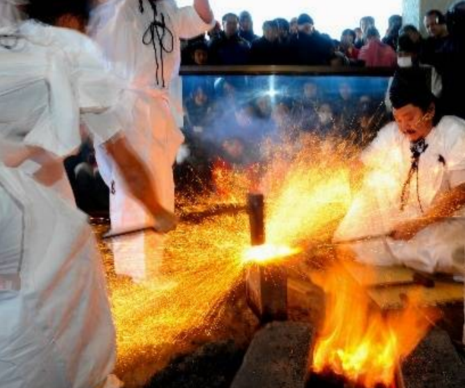
Seki is famous worldwide for its production of knives, ranking alongside Solingen GER.